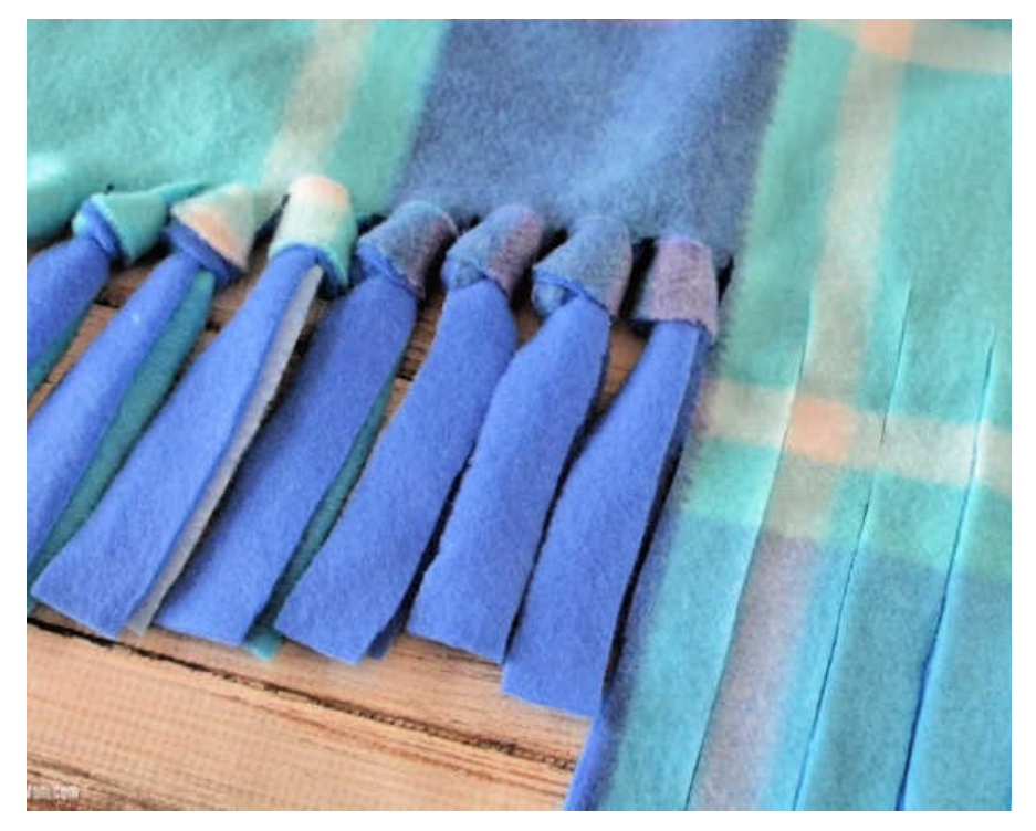
Step 5: Choose how you tie the knots. Your choice of knots will change how the blanket looks. If you've chosen a pattern and a solid color, you may want the knot to display the pattern on the solid side and vice versa. Here's how: