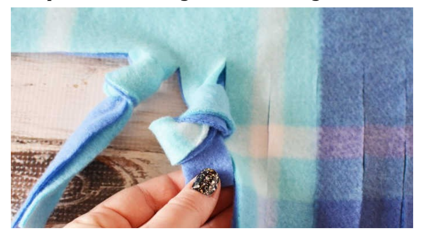
Step 4. Begin tying the two slits together. You have a choice here, you can either do a standard double knot or "hand knot".