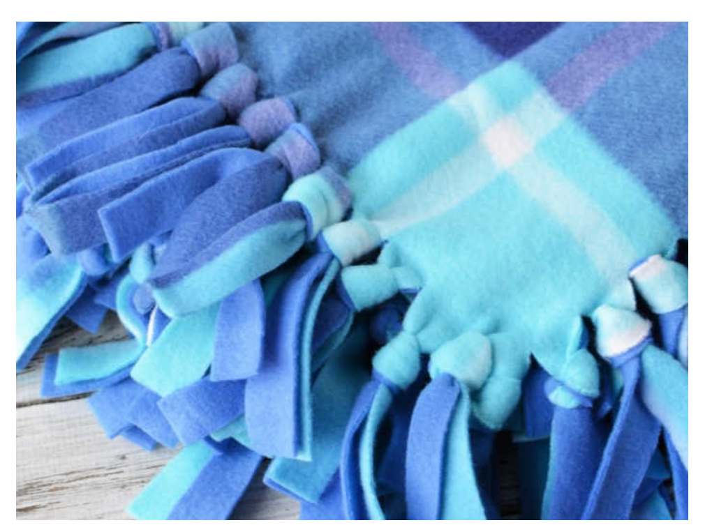
Step 6. Pull the knots down just a little bit from the top of the fringe. This will make for a clean, crisp line and will avoid tugging, bunching and a misshapen blanket. Be sure to remove ALL pins.

Or choose a hand knot: grab both strips simultaneously and loop them around your index and middle fingers and make a knot.