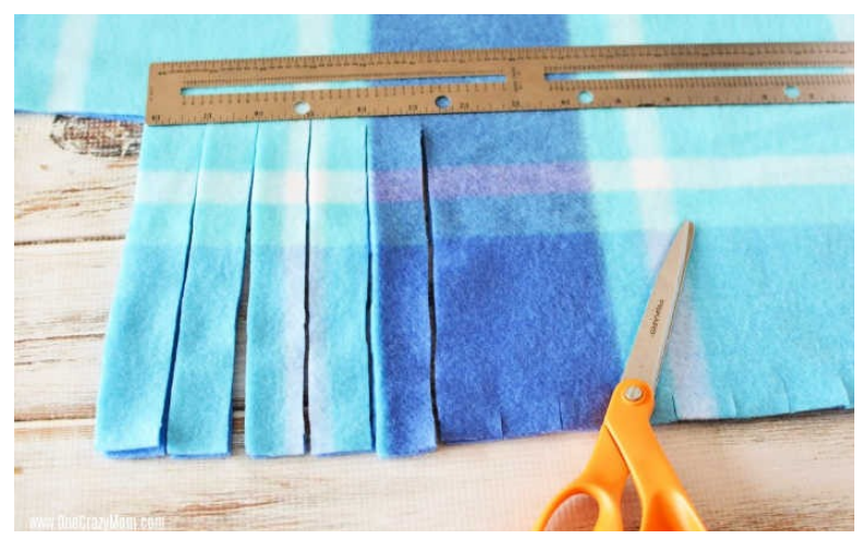
Step 3. Cut strips, 1" wide and 4" long, cutting both pieces of fabric at same time. Use yardstick to evenly space.