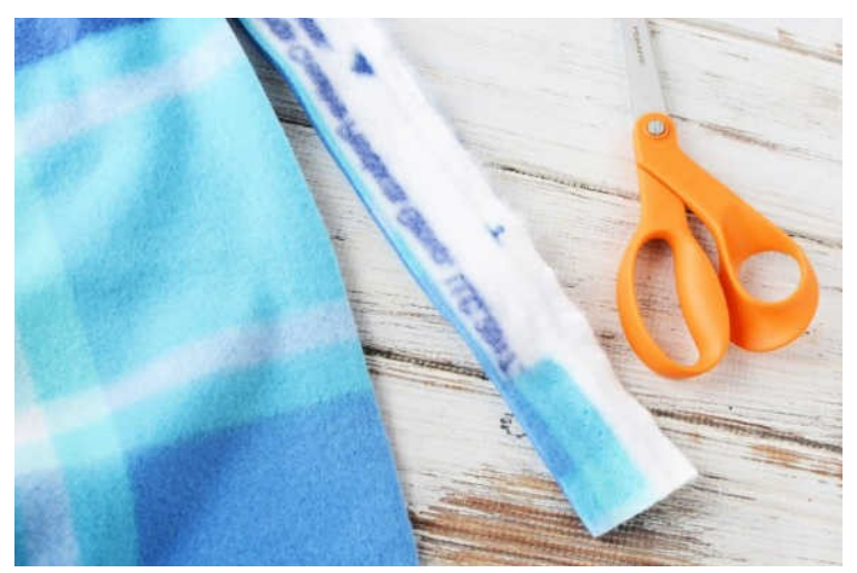
Step 1 . Lay both fleece pieces on top of each other, with wrong sides together. Use pins to keep fleece together. Take yardstick or any straight edge and cut off any ends so they are same size.